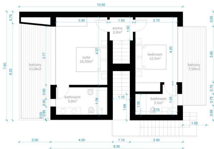
Planta Piso 1